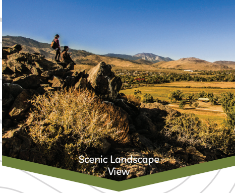
Scenic Landscape View