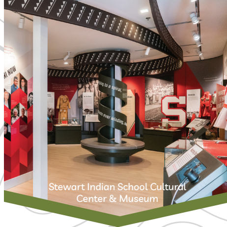
Stewart Indian School Cultural Center & Museum